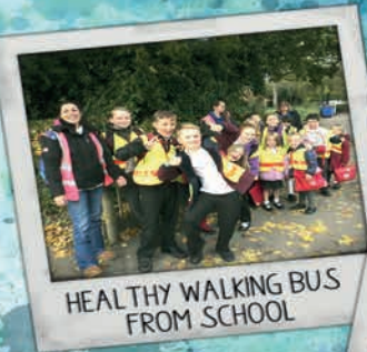
HEALTHY WALKING BUS FROM SCHOOL