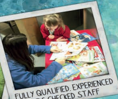
FULLY QUALIFIED, EXPERIENCED DBS CHECKED STAFF