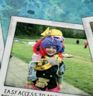
EASY ACCESS TO AN OUTDOOR AREA INCLUDING LARGE FIELD, ENCLOSED PATIO AND SPORTS COURTS