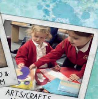
ARTS/CRAFTS AND GAMES