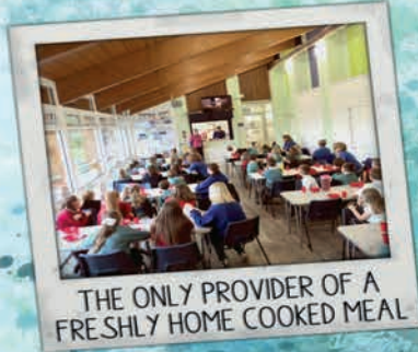
THE ONLY PROVIDER OF A FRESHLY HOME COOKED MEAL