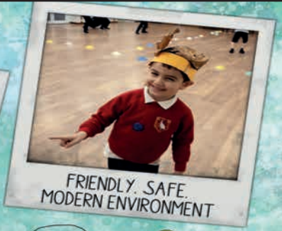
FRIENDLY, SAFE, MODERN ENVIRONMENT